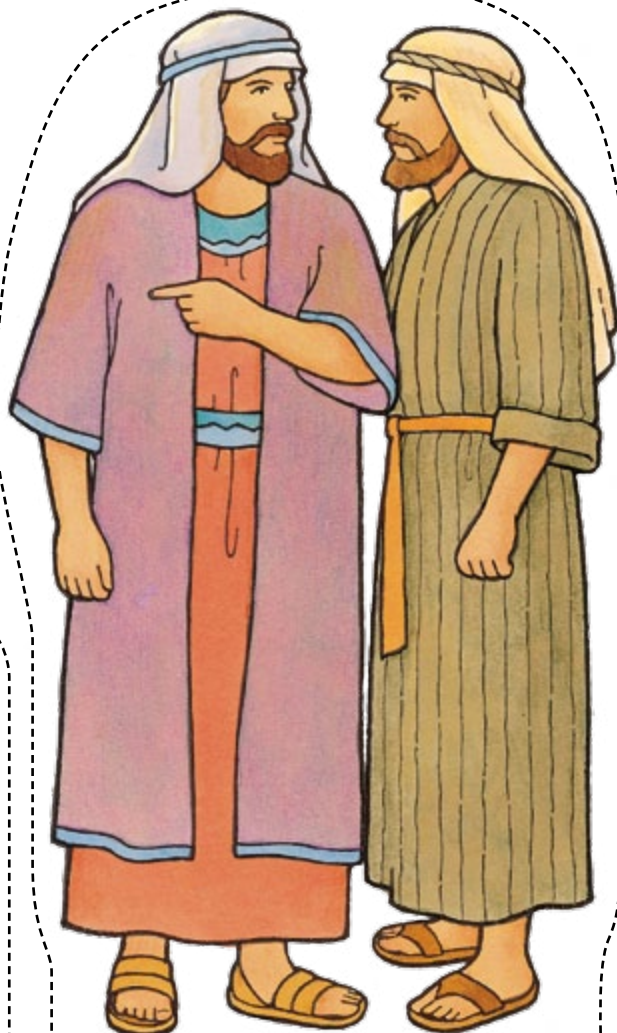
Laman and Lemuel