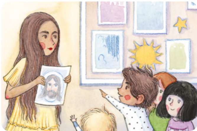
They hold up a picture. "That's Jesus!" Hugo says.