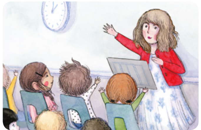
Hugo goes to singing time. The songs make him feel happy.