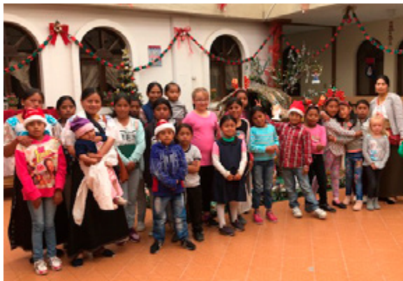
Primary children in the Imbabura Province, Ecuador , sang Christmas carols at a nursing home and gave out cookies.

Every year, I go to my neighbors' house to set up their Christmas tree. Their only child died right after Christmas, so Christmastime is sad for them. When I go to their house, I feel like I am cheering up their day, and it makes me feel good.