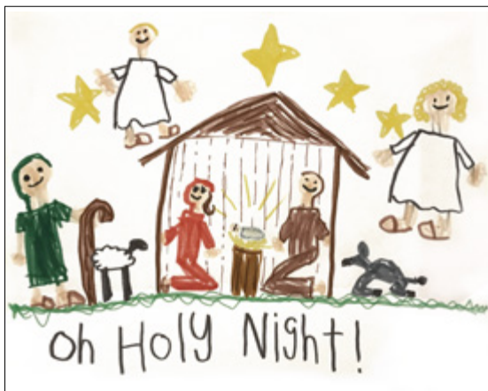
Cade I., age 8, Texas, USA