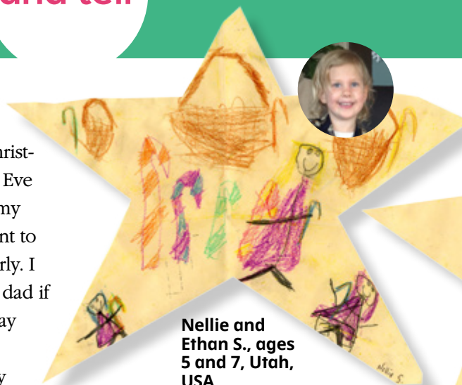
Nellie and Ethan S., ages 5 and 7, Utah, USA