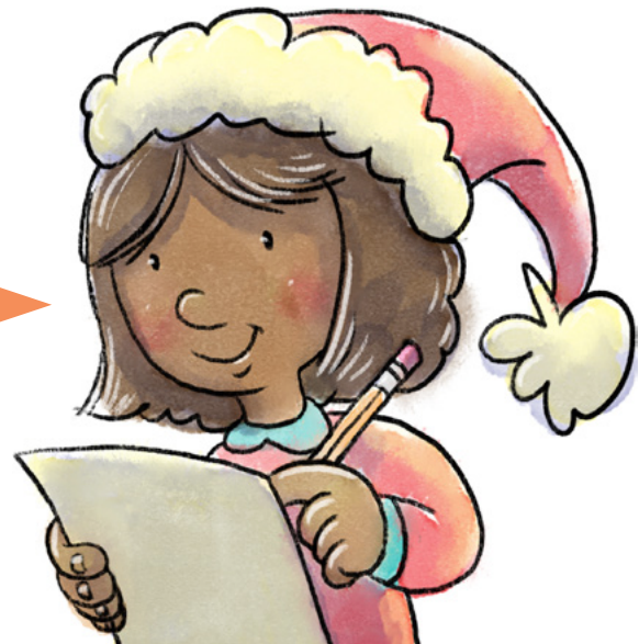
ILLUSTRATION BY BRAD TEARE