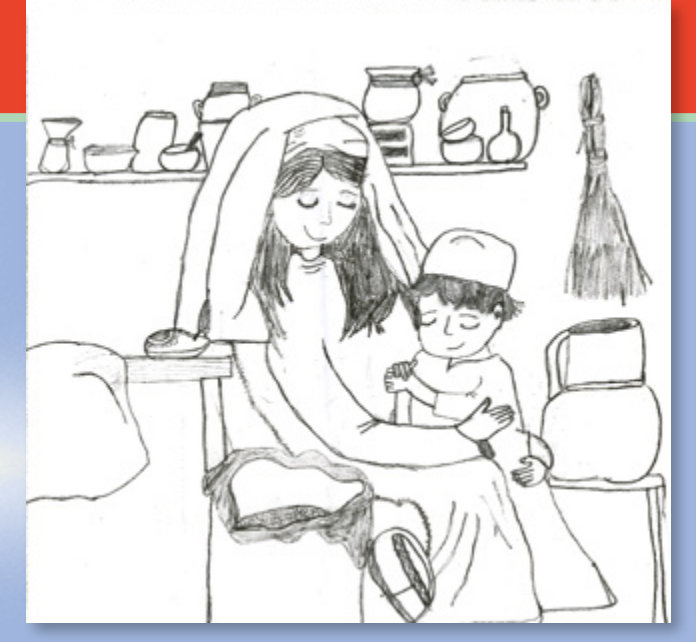
Alexis B., age 9, Utah, USA

Watch a video of children reading scriptures about the Savior at friend.lds.org!