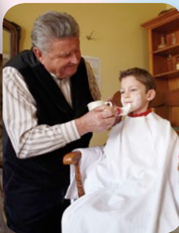
The town barber sent leftover hair from haircuts and shaves to toymakers to use as hair for dolls.