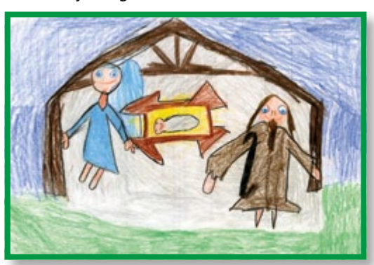
Wendy W., age 7, New South Wales, Australia