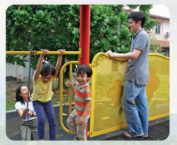
Keluarga means "family" in Malay. This family likes to play together at the park.

Malaysia is a beautiful country in Southeast Asia. There are about 10,000 members of the Church and 33 branches in Malaysia. The Church there is small but strong!