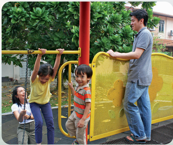
Keluarga means "family" in Malay. This family likes to play together at the park.

Malaysia is a beautiful country in Southeast Asia. There are about 10,000 members of the Church and 33 branches in Malaysia. The Church there is small but strong!