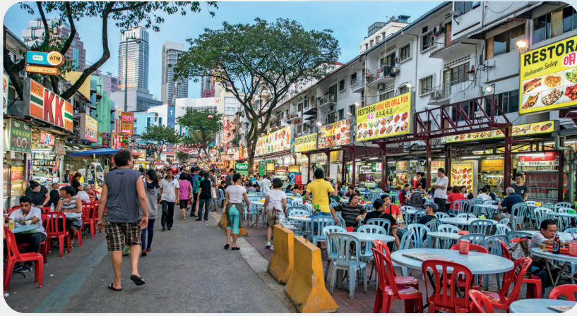
Families in Malaysia like to go out to eat together. People can buy street food all day and night.