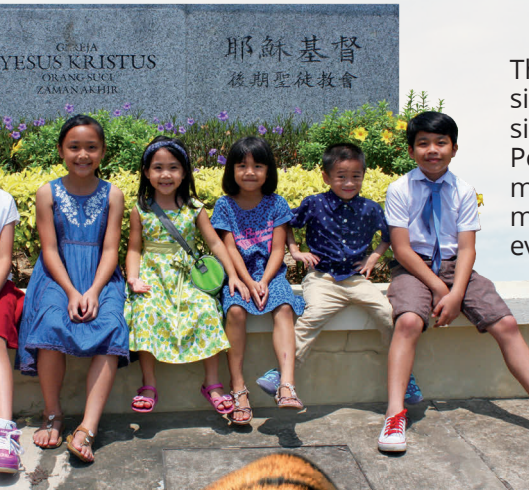
These Primary children are sitting in front of a Church sign in Malay and Chinese. People in Malaysia speak many languages. At church, members help translate so everyone can understand.