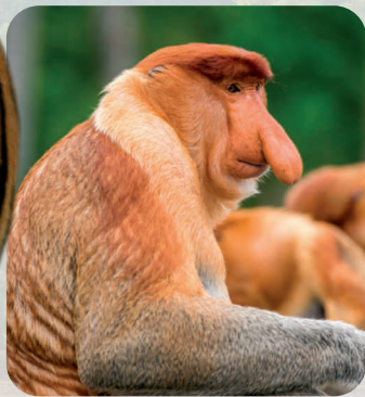
More than half of Malaysia is covered in tropical forests. It's home to amazing animals like the Malayan tiger and the proboscis monkey.