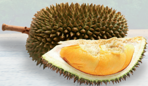
Durian is the strongest-smelling fruit in the world! Many people in Malaysia love this creamy fruit. It's used to make candy, ice cream, and other treats.