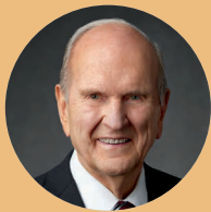
By President Russell M. Nelson