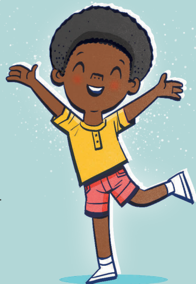
Help you be free from harmful habits.