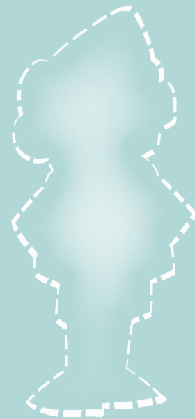
Protect your spirit.

Remember, God and His angels are always there to help you. ●