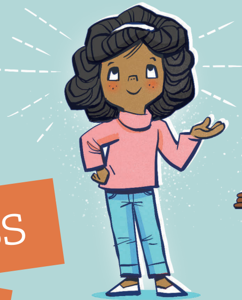
Bless you with light and joy.

You are a child of God. God gives us commandments to bless us and bring us joy. Sometimes people pick which commandments they will keep and which ones they won't. Trying to obey all of God's commandments will: