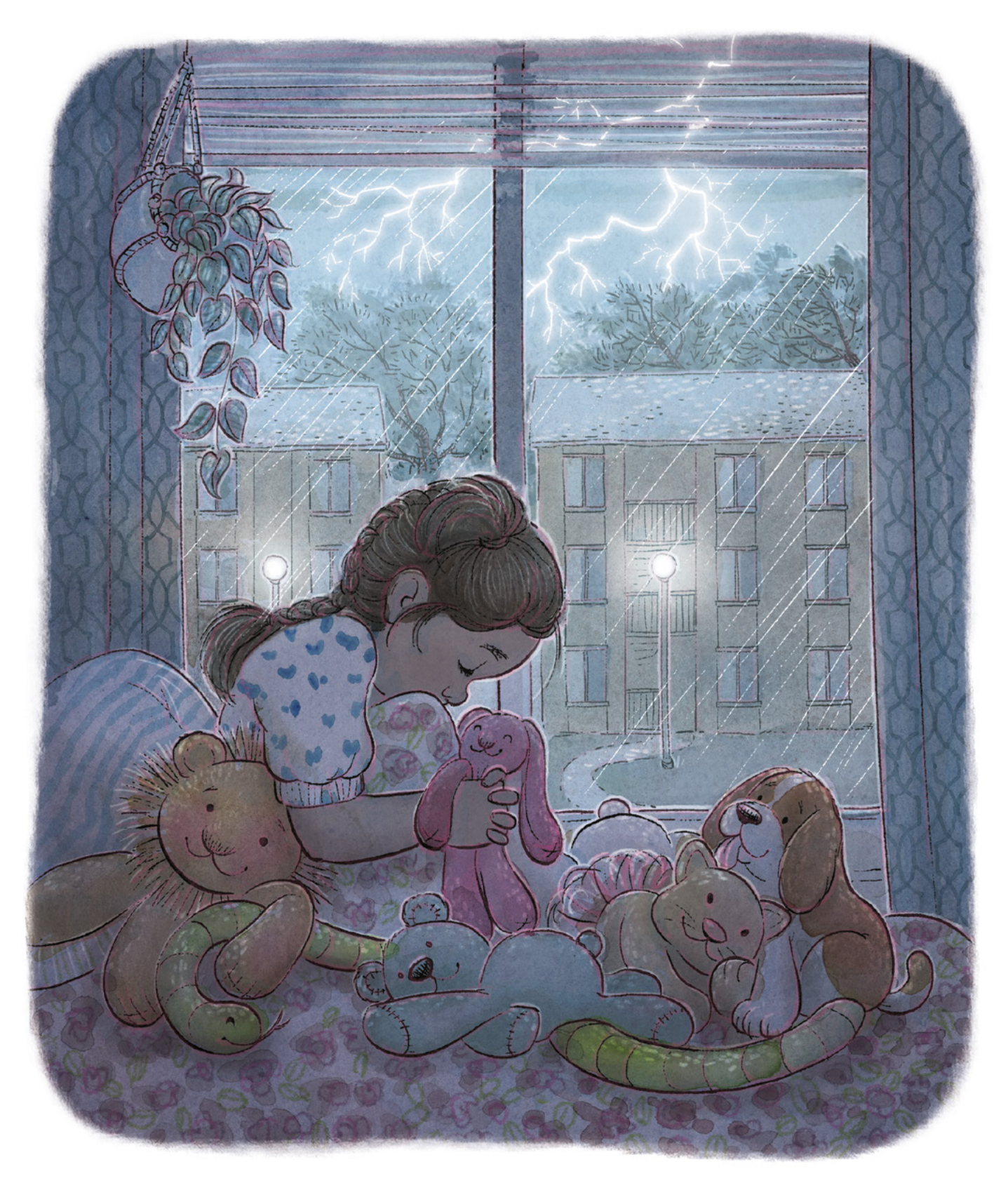
Sometimes I face scary problems. When I ask God for help, He helps me be strong.