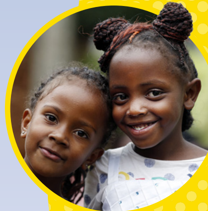
These girls saw President Nelson in Nairobi, Kenya.