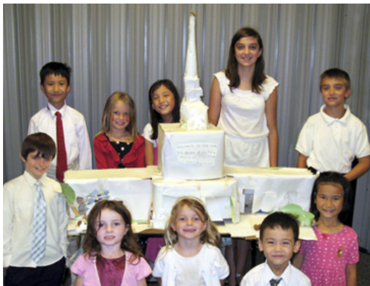
The Stratford Branch Primary, Kitchener Ontario Stake, Ontario, Canada , enjoyed making a model of the Toronto Ontario Temple during their branch temple trip. They look forward to seeing this model in the Primary room on Sundays.