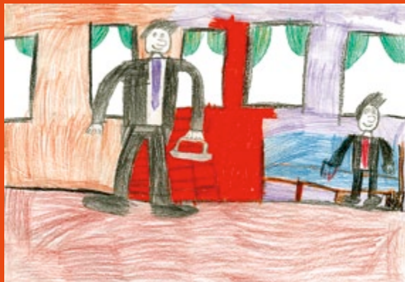
Roman L., age 7, New South Wales, Australia