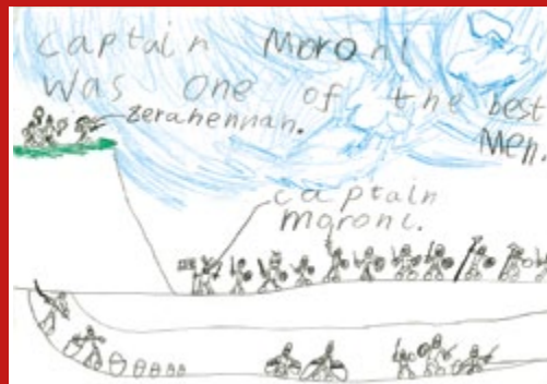
Simeon J., age 6, England