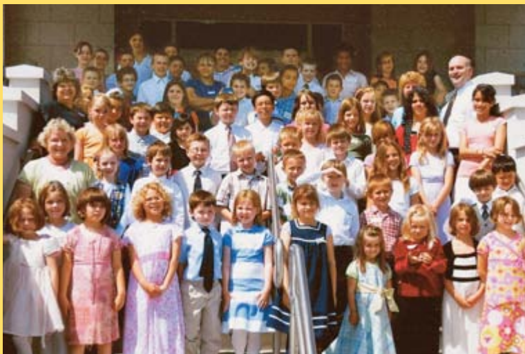
Lewvan Ward Primary Primary children of the Lewvan Ward, Regina Saskatchewan Stake, celebrated President Thomas S. Monson's birthday by listening to a message from their stake president about the importance of following the prophet. Then they made birthday cards.