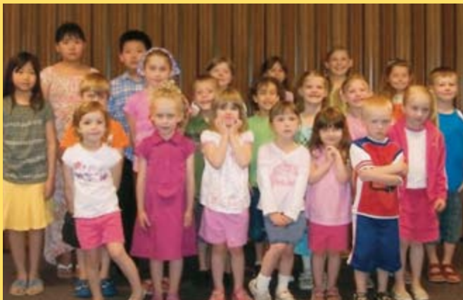
Duluth Stake Primary "Primary Temple Day" was an exciting experience for the Primary children of the Duluth Minnesota Stake. They participated in temple-themed activities, games, and songs, then toured the grounds of the St. Paul Temple and even visited with the temple president.