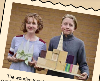
The wooden temple Sam's mom owned survived the fire! It was found in their melted minivan weeks later.