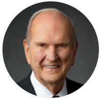
By President Russell M. Nelson