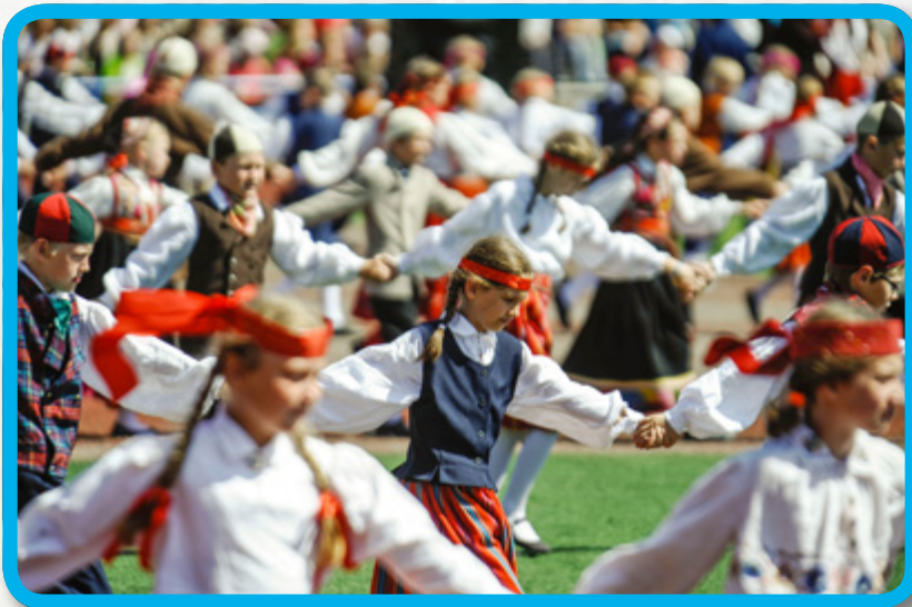
Every five years, Estonians gather at a big festival to celebrate their country with dancing and singing. What's your favorite Primary song?

Are you from Estonia? Write to us! We'd love to hear from you.