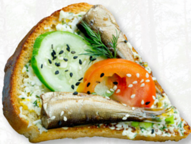
What's for dinner in Estonia? Maybe sprats (pickled fish) on black bread.