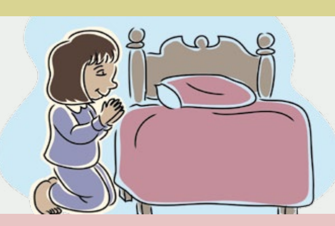
Listen to the voice of current and past prophets.

Learn about the great plan of happiness by studying the scriptures.