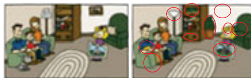
Page 43 Funstuf answer:

The Friend can be found on the Internet at friend.lds.org . To subscribe online, go to ldscatalog.com .