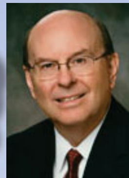
Elder Quentin L. Cook of the Quorum of the Twelve Apostles shares some of his thoughts on this subject.

3. Be a good example and take every opportunity to share the gospel.