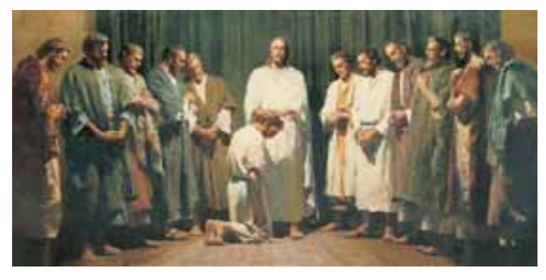
Twelve Apostles in New Testament times