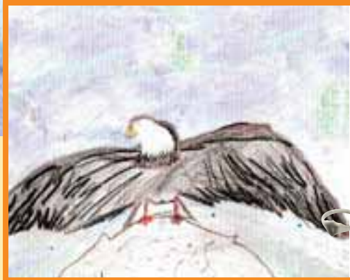
Keely V., age 10, Wyoming

Would you like to send us a poem or drawing? Turn to the inside back cover to find out how.