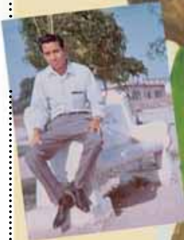
At about age 16, not long after his baptism.