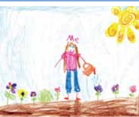
Breely B., age 6, Utah