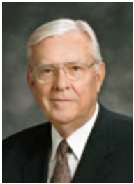
By Elder M. Russell Ballard Of the Quorum of the Twelve Apostles