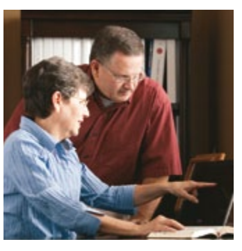
6. We then prepare the names of our ancestors for temple work and perform necessary ordinances for them in the temple (see 1 Corinthians 15:29; D&C 128:15–16, 24).