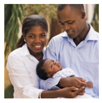
5. Children born to a sealed couple are born "in the covenant." Children who are not born in the covenant may be sealed to their parents.