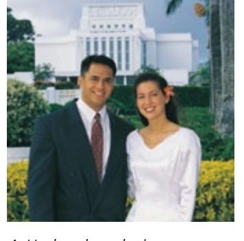
4. Husbands and wives are sealed (married) in the temple for time and all eternity.