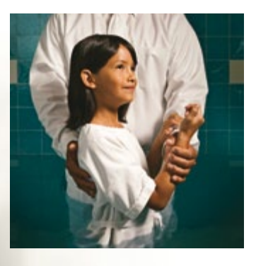
1. We are baptized and confirmed (see Matthew 3:16–17; John 3:5; 2 Nephi 31:5–18).