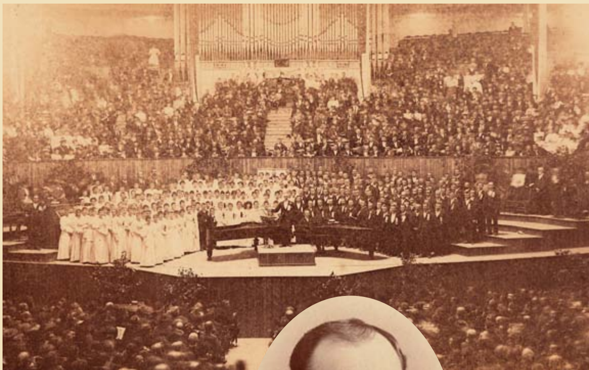
Left: The Tabernacle Choir performing at the Chicago World's Fair, 1893. Left inset: Evan Stephens, Tabernacle choir conductor. Right: The Tabernacle Choir at the World's Fair in 1934.