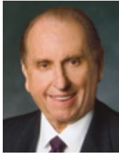
By President Thomas S. Monson