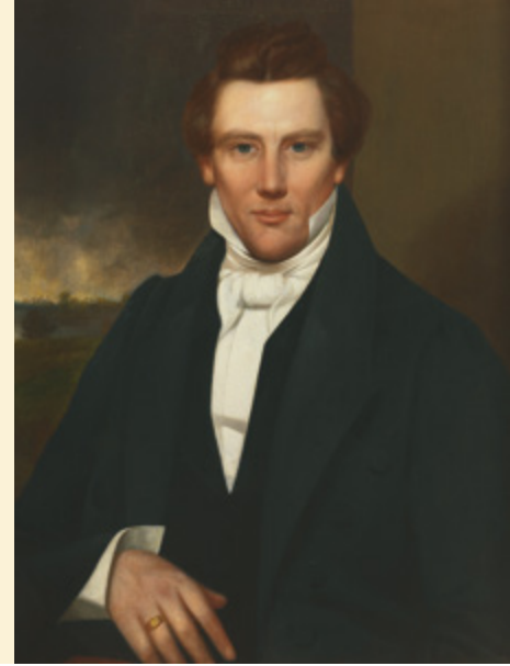
For thousands of members during his lifetime and millions since his death, Joseph Smith has been known as prophet, seer, and revelator.

“Seeing” and “seers” were part of the American and family culture in which Joseph Smith grew up. Steeped in the language of the Bible and a mixture of Anglo-European cultures brought over by immigrants to North America, some people in the early 19th century believed it was possible for gifted individuals to “see,” or receive spiritual manifestations, through material objects such as seer stones. 7