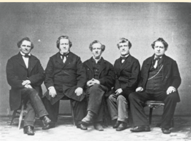
PHOTOGRAPH CIRCA 1866