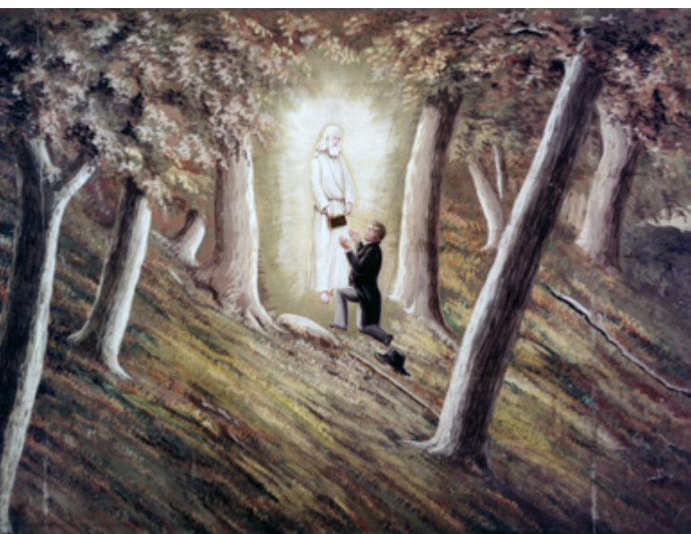
THE ANGEL MORONI DELIVERING THE PLATES TO JOSEPH SMITH, BY C. C. A. CHRISTENSEN

Members of the Church throughout its history have sought to understand the early history of Joseph Smith and his finding and translating the golden plates. This image by artist C. C. Christensen in 1886 depicts Joseph Smith obtaining the plates from the angel Moroni.