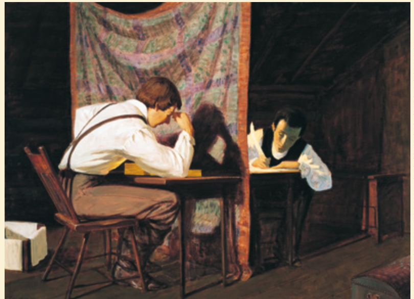
TRANSLATION OF THE PLATES, BY EARL JONES

Artist's rendition of Joseph Smith translating while wearing the breastplate with the attached interpreters or spectacles, later referred to as the Urim and Thummim.