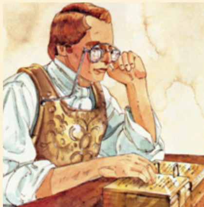
ILLUSTRATION BY ROBERT T. BARRETT

Artist's depiction of Joseph Smith and a scribe translating with a blanket between them. Although no blanket is mentioned in most descriptions of the translation process, one was apparently used at an early point to shield the scribe from a view of the plates, spectacles, or breastplate. During the latter part of the translation effort, a blanket may have been used to shield the translator and scribe from other individuals curious to observe the translation.