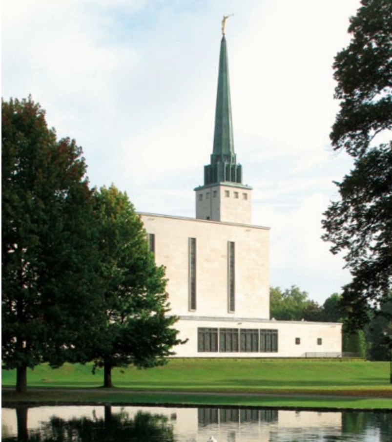
The London England Temple.