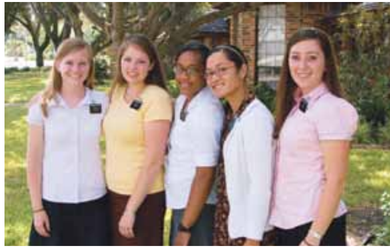
Missionaries in the Texas McAllen Mission have benefited from the efforts of local members in sharing the gospel.

principle of the gospel." Members need to know gospel principles well enough, he emphasizes, to pique people's interest and prepare them to meet the missionaries.