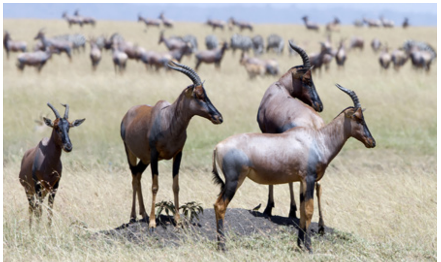
For a topi, a brief moment of carelessness or inattentiveness could invite a swift attack from a cheetah. Likewise, spiritual complacency and casualness make us vulnerable to the advances of the adversary.

The Father's plan of happiness is designed to provide direction for His children, to help them experience enduring joy, and to bring them safely home to Him with resurrected, exalted bodies. The devil labors to make the sons and daughters of God confused