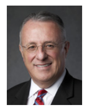
By Elder Ulisses Soares Of the Quorum of the Twelve Apostles