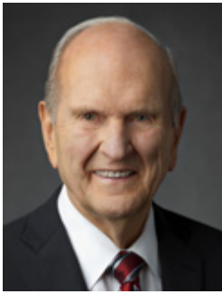
By President Russell M. Nelson