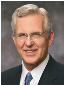
By Elder D. Todd Christofferson Of the Quorum of the Twelve Apostles