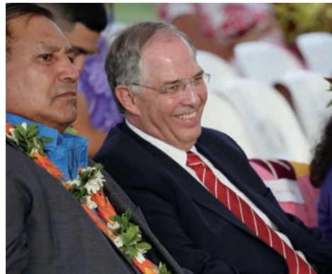
Below: Elder Neil L. Andersen visits Rarotonga; Elder Quentin L. Cook meets with the president of the Republic of El Salvador; Elder Jeffrey R. Holland listens during a conference on religious persecution at Windsor Castle, England.