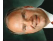
Ronald A. Rasband