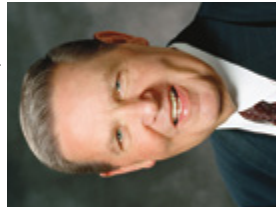
Jeffrey R. Holland