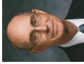
Henry B. Eyring First Counselor