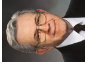
Boyd K. Packer