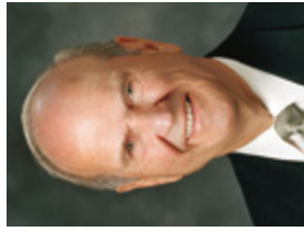
Russell M. Nelson