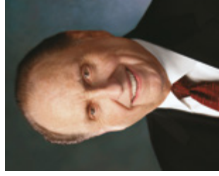
Thomas S. Monson President