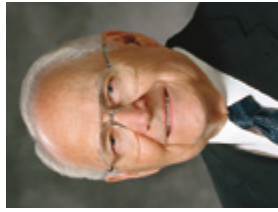
L. Tom Perry