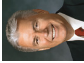
Dieter F. Uchtdorf Second Counselor