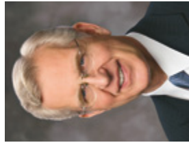
D. Todd Christofferson