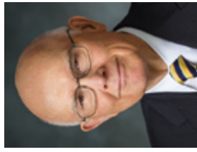
Dallin H. Oaks