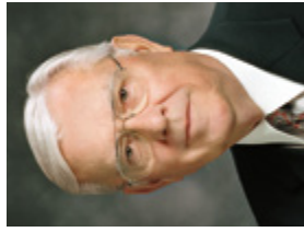
M. Russell Ballard