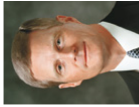
David A. Bednar