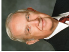
Richard G. Scott