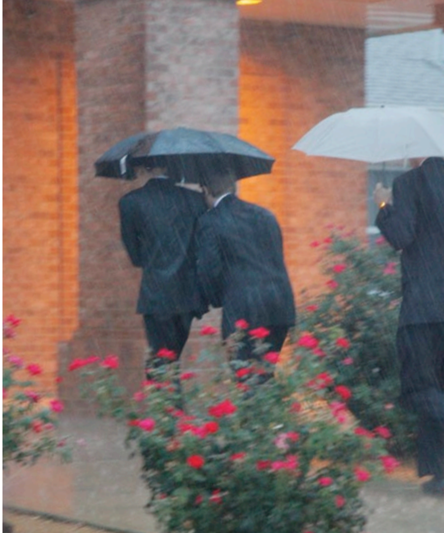
Colleyville, Texas, USA