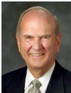
By Elder Russell M. Nelson Of the Quorum of the Twelve Apostles

Because of the multiplicity of experiences and the power with which the Spirit has witnessed to me, I testify with absolute surety that God lives. I feel His love. It is the sweetest feeling. May we do what is needed to align our will with His and truly love Him. In the name of Jesus Christ, amen. ■