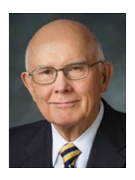
By Elder Dallin H. Oaks Of the Quorum of the Twelve Apostles

Scan this QR code or visit lds.org/go/Oct13Conf13 to share a designed quotation or short video from this message.