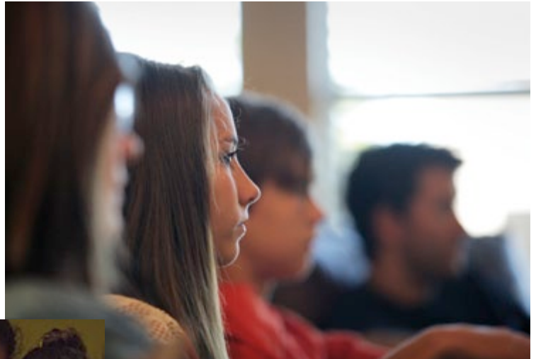
Coverage of general conference, in the words of President Thomas S. Monson, reached “across the continents to people everywhere.” Pictured clockwise from top left are members and missionaries in Rome, Italy; Cavite, Philippines; Lima, Peru; Colleyville, Texas, USA; Foz do Iguaçu, Brazil; London, England; Arraiján, Panama; and Lyon, France.