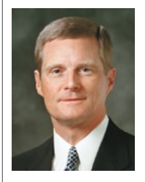
By Elder David A. Bednar Of the Quorum of the Twelve Apostles