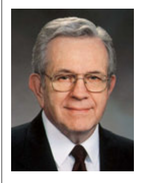
By President Boyd K. Packer President of the Quorum of the Twelve Apostles