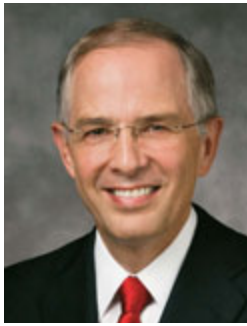
By Elder Neil L. Andersen Of the Quorum of the Twelve Apostles