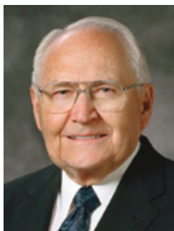
By Elder L. Tom Perry Of the Quorum of the Twelve Apostles