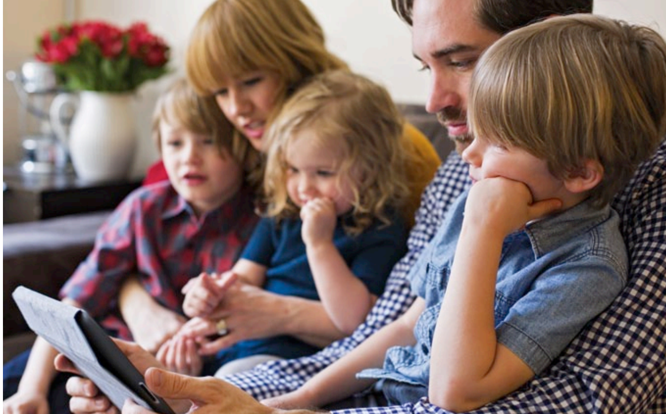
New York City, New York, USA

asked him about his family. She was surprised as he responded that he had no family. He further explained that at his birth, his mother had given him to the government to raise. He spent his childhood going from one foster home to another. He was blessed as a teenager to find the gospel. A loving ward family had helped him to have the opportunity to serve a mission.