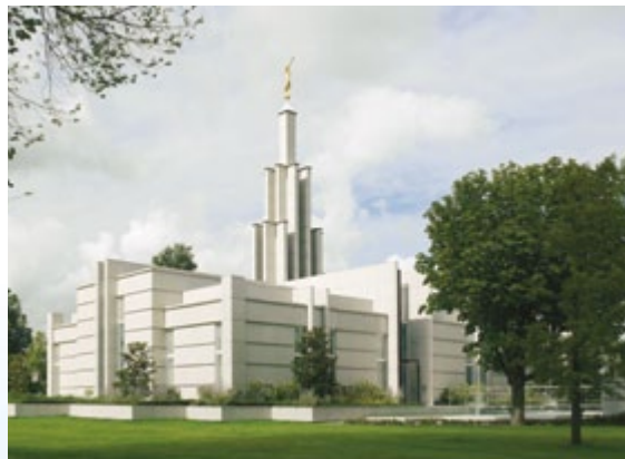
The Hague Netherlands Temple

dedicated The Hague Netherlands Temple, which serves five stakes and one district in the Netherlands, Belgium, and part of France.