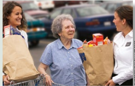
Sister missionaries help an elderly woman with her groceries.