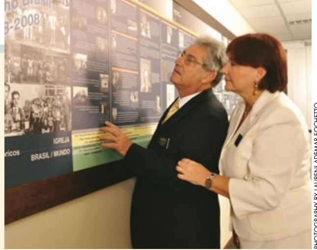
PHOTOGRAPHY BY LAURENI ADEMAR FOCHEITTO