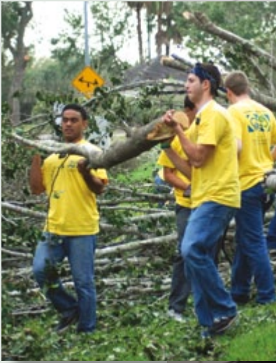
Missionaries in Houston, Texas, help clean up after Hurricane Ike in 2008.