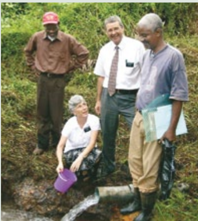
A senior couple at a spring in the DR Congo.

For the complete text of President Thomas S. Monson’s talk go to lds.org/general-conference/2010/10/as-we-meet-together-again