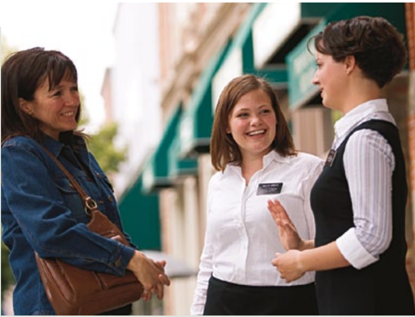
Sister missionaries enjoy talking about the gospel with a local woman.